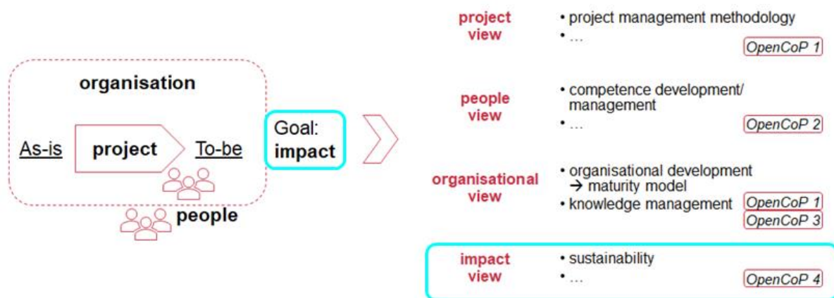
Figure 1: Impact (goal) focus of the research on managing the digital transformation with projects.

The research about projects for the digital transformation covers different views on the topic, especially the project view, the people view, the organisational view, and the impact view. The research on the DSC is a relevant part of the impact view, addressing two research questions: How do we keep the impact of the transformation in mind? How do we guarantee sustainability?